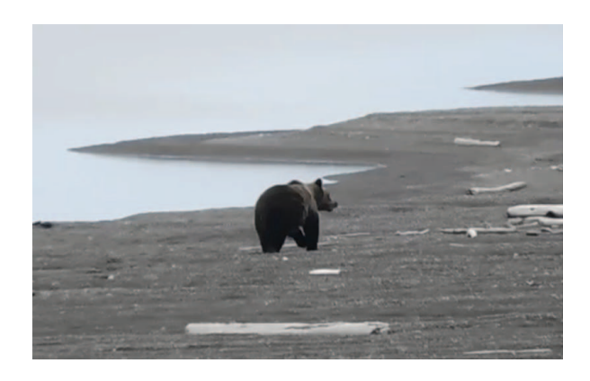
Fig. 2. A confirmed brown bear ( Ursus arctos ) on Bruch Spit, Wrangel Island, Russia, on 28 August 2019.

Most adult females in the Chukotka–Alaska polar bear population (also referred to as the "Chukchi Sea subpopulation," with different boundaries; Durner et al. [2018]) build their maternal dens on Wrangel Island (Belikov 1977, Rode et al. 2018). Each year, a substantial proportion of the approximately 3,000 bears in the population (Regehr et al. 2018) spend the summer and autumn on Wrangel, waiting for the sea ice to reform (Kochnev 2002, Ovsyanikov and Menyushina 2010, Rode et al. 2015). Climate change has led to declines in the extent and thickness of Arctic sea ice (MacDonald 2010, AMAP 2017), which has negatively affected some of the world's 19 polar bear subpopulations (Durner et al. 2018) and is expected to affect nearly all polar bears in the longer term (Atwood et al. 2016, Regehr et al. 2016). As polar bears are forced to spend longer periods on land (Stirling and Derocher 2012, Wilson et al. 2017), opportunities for contact with brown bears will likely increase where the ranges of the species overlap.