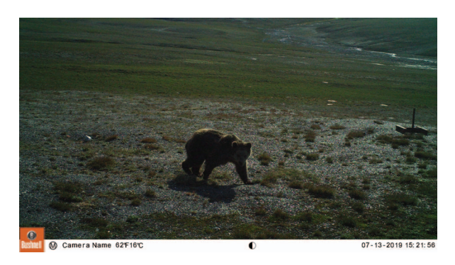
Fig. 3. An apparent brown bear ( Ursus arctos ) photographed by a remote camera trap on Cape Waring, Wrangel Island, Russia, on 13 July 2019.

We routinely perform ground-based observational surveys for multiple wildlife species on Wrangel Island during the summer and autumn. On 28 August 2019 during a survey on Bruch Spit, located on the east coast of the island (approx. N71.34° W177.79°), we sighted a running bear that had been resting in a daybed prior to being disturbed by the sound of our vehicles (Fig. 2). The bear had features characteristic of brown bears including a dark coat, distinctive hump, and shortened face (Geptner et al. 1967). The bear appeared healthy and in good body condition. We gathered approximately 10 hairs for genetic